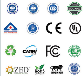
OUR CERTIFICATIONS & RECOGNITION

Book a demo with Intex or call us as: INTEX TECHNOLOGIES (INDIA) LTD.