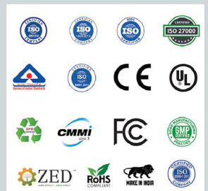
OUR CERTIFICATIONS & RECOGNITION

Book a demo with Intex or call us as: INTEX TECHNOLOGIES (INDIA) LTD.