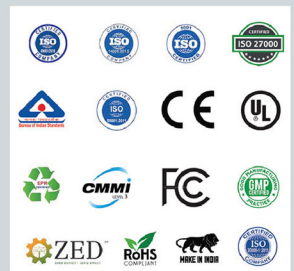
OUR CERTIFICATIONS & RECOGNITION

Book a demo with Intex or call us as: INTEX TECHNOLOGIES (INDIA) LTD. Regd. Office: A-61, Okhla Industrial Area, Phase-II, New Delhi-110020 www.intex.in | Email: manish.saxena@intex.in Contact No.: 9711198729