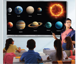
INNOVATING LEARNING EXPERIENCE