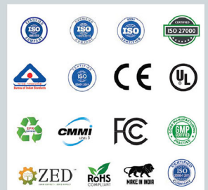
OUR CERTIFICATIONS & RECOGNITION

Book a demo with Intex or call us as: INTEX TECHNOLOGIES (INDIA) LTD.