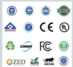
OUR CERTIFICATIONS & RECOGNITION

Book a demo with Intex or call us as: INTEX TECHNOLOGIES (INDIA) LTD.