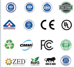
OUR CERTIFICATIONS & RECOGNITION

Book a demo with Intex or call us as: INTEX TECHNOLOGIES (INDIA) LTD.